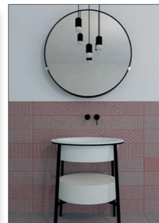
Images: 1. Domestic Jungle, 2. Squares, 3. Decò, 4. Terra Mia, 5. Manufatto, 6. Maiolicata.